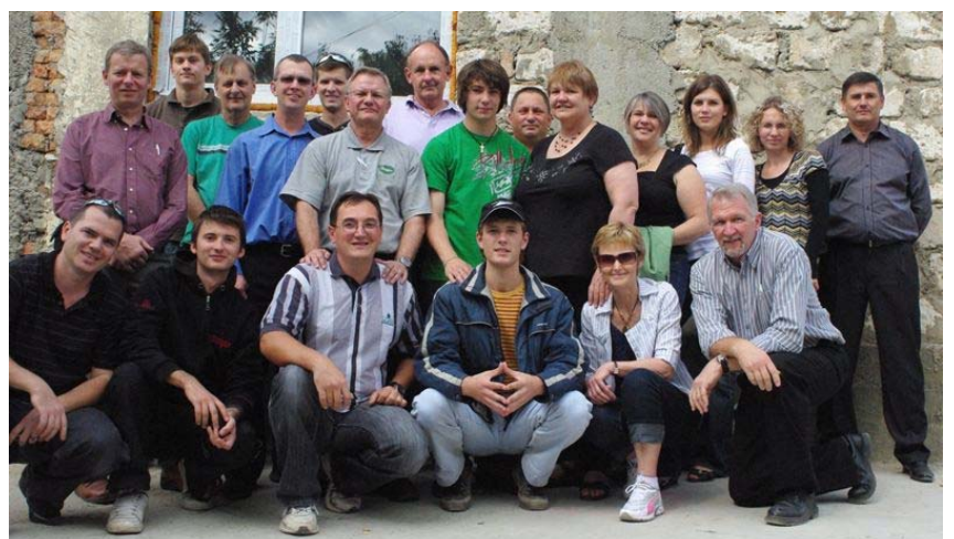
Team & Interpreters in Dubasari